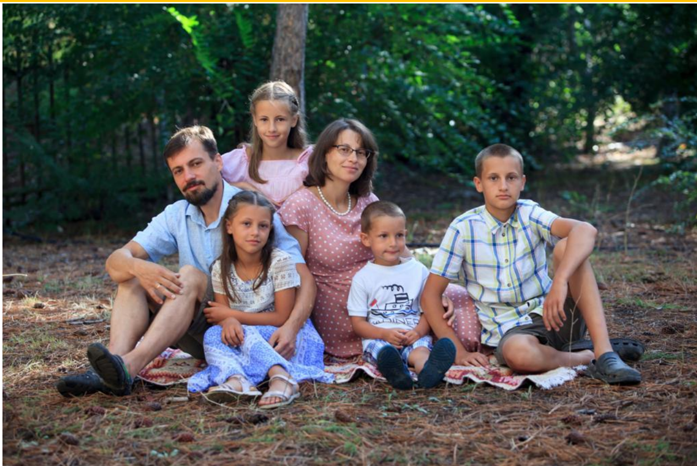
The Kulakovi-family with four children.