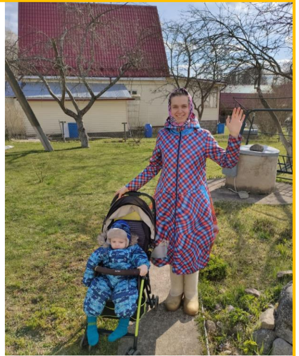
Malevich family with four children. They also want to give their children the best conditions for growing up.