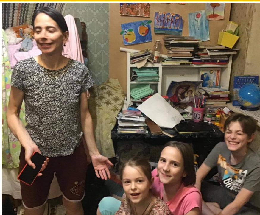
We also want to send a donation to Olga and Ilya Korshunovs, who have five children.